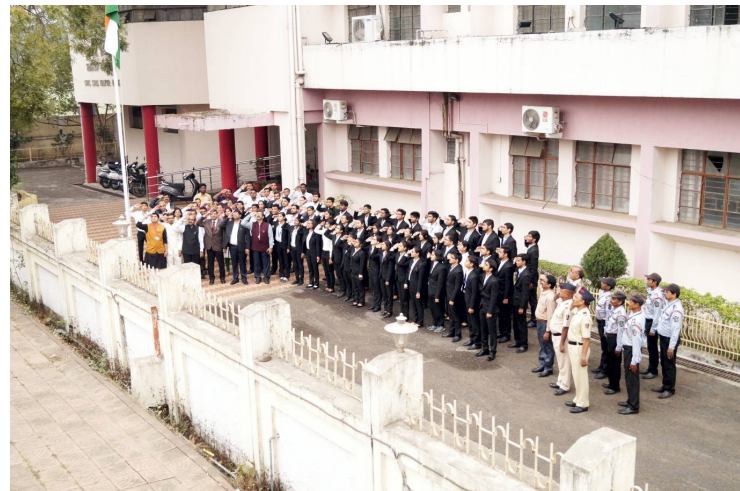
Republic Day Celebrations at the University on January 26, 2017.